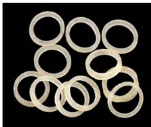
ITEM # 450-___ (Natural)