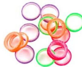
ITEM # 450N-___ (Neon)